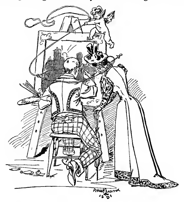
IT WAS A VIOLENT CASE OF MUTUAL LOVE AT FIRST SIGHT.

Of course the stranger was very soon at his ease and chatting along comfortably. The average American